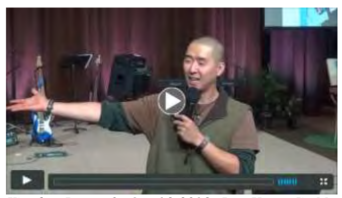
Kingdom Reversal - Oct. 16, 2016 - Rev. Hyung Jin Moon

In a nation based on free enterprise, if I don't act morally, people will not trust or want to do business with me, but in a corrupt nation, people succeed by manipulating government decisions. <u>People in poor countries often suffer not because of a lack of national resources, but because of the political system, corruption and control mechanisms in those countries.</u>