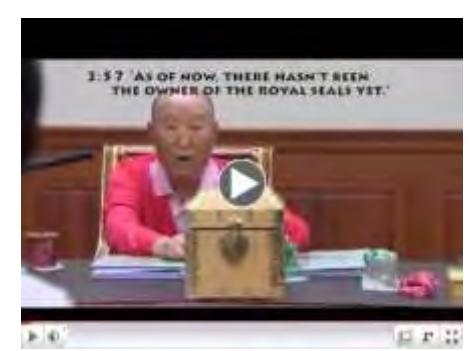
2012:07:24 HDH- God of Night and God of Day still fighting

Previous questions the Family Federation has not yet answered: