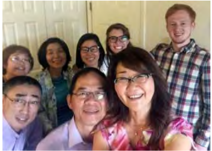
Chicago Sanctuary Service Worshippers