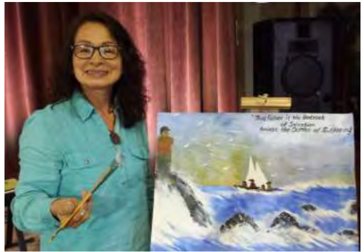
Miho Panzer Praise Painting based on 2016 Motto: "True Father is the Bedrock of Salvation Amidst the Ocean of Suffering"