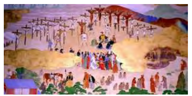
17th Century Japanese Christian Martyrs

Am I wrong to understand that those who do not attend the public ceremony or write an enthusiastic resolution form are identified as not accepting the new Born Sinless Only Begotten Daughter theology that has been imposed on the Unification Movement since Father's passing? Am I wrong to understand that the district pastor will have a list of those who do not attend the public ceremony or write a half-hearted resolution form?