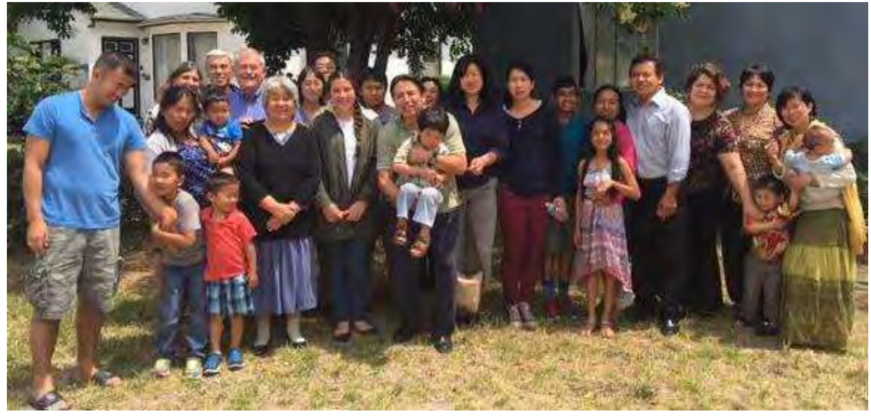
May 29 Unification Sanctuary worshippers in Los Angeles