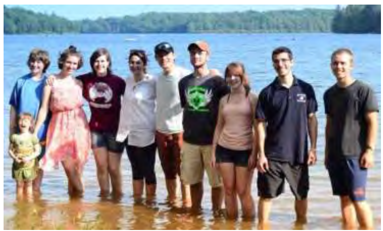
Celebrating the 2nd Unification Sanctuary Anniversary at Promised Land State Park

The current U.S. Presidential campaign is bringing out "forbidden" issues much as during the time of the 1980 election involving Ronald Reagan and Jimmy Carter. But unlike 1980, the U.S. now has $20 trillion in debt, indenturing future generations of America to a heavy burden that will squeeze out other needs. For an urgently needed change or revolution to be successful it has to happen within the elites. George Washington was an "Abel-type elite" who fought for freedom from interference of corrupt elites in London.