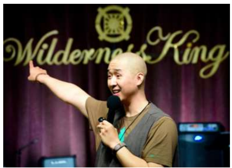
May 29, 2016 Sanctuary Sermon

Now there is an effort for a proposed new museum project in Chung Pyung which will be the "grandest in the world." But when the spirit of God is not there, it does not matter how large the building is.