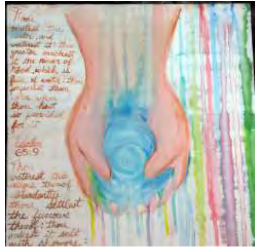
Praise Painting based on Psalm 65_9

Marxism is the opiate of the intellectuals, who often are attracted to central planning and government control by an "enlightened elite" in their own image, but they don't get rid of the monopolies, they become the monopoly, regulating everything. Venezuela is an example of centralized control which promised utopia , but has destroyed people's freedoms and livelihoods. The Tao Te Ching, which is 4,000 years old, taught that the king who rules least is the one that rules best. He does not interfere in peoples' lives.