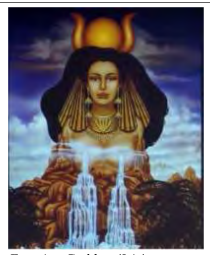
Egyptian Goddess 'Isis'

Egyptians worshipped Isis, who wore a headdress that has a round womb-like shape in the middle of two curved "fallopian tubes." Such "womb theology" endorsed the power of an authoritarian "mother" state hierarchy that promised to take care of and nurture its helpless and disempowered inhabitants. Similarly, current pagan religion includes the worship the Mother Earth Goddess "Gaia."