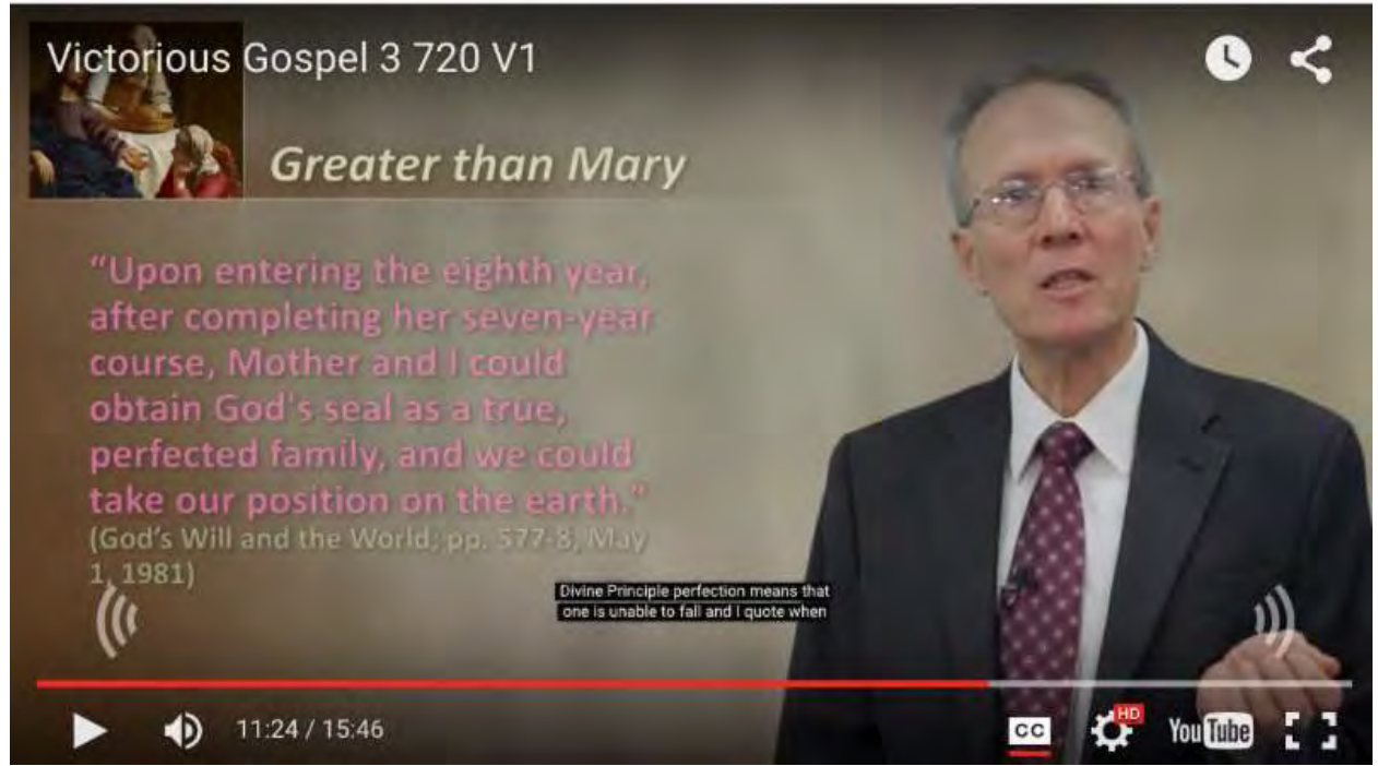
Victorious Gospel of True Parents- Part 3

"Even under such circumstances she still kept up with it all, and in the end she became the True Mother who is even greater than the holy Mother Mary. The most admirable point about Mother was that she believed in me more than in her own father, grandfather or elder brother. She believed in me 100 percent. Thus she overcame all the obstacles and established a firm position...Whatever happened, even if she should die, she had to keep an unchangeable attitude toward her husband." God's Will and the World, 577-8, May 1, 1981