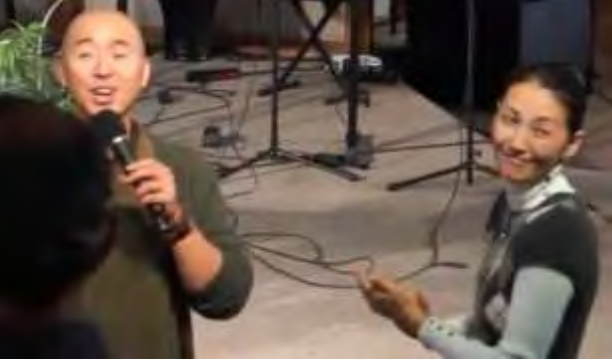
"The Eternal Kingdom" Sermon, 10/18/2015