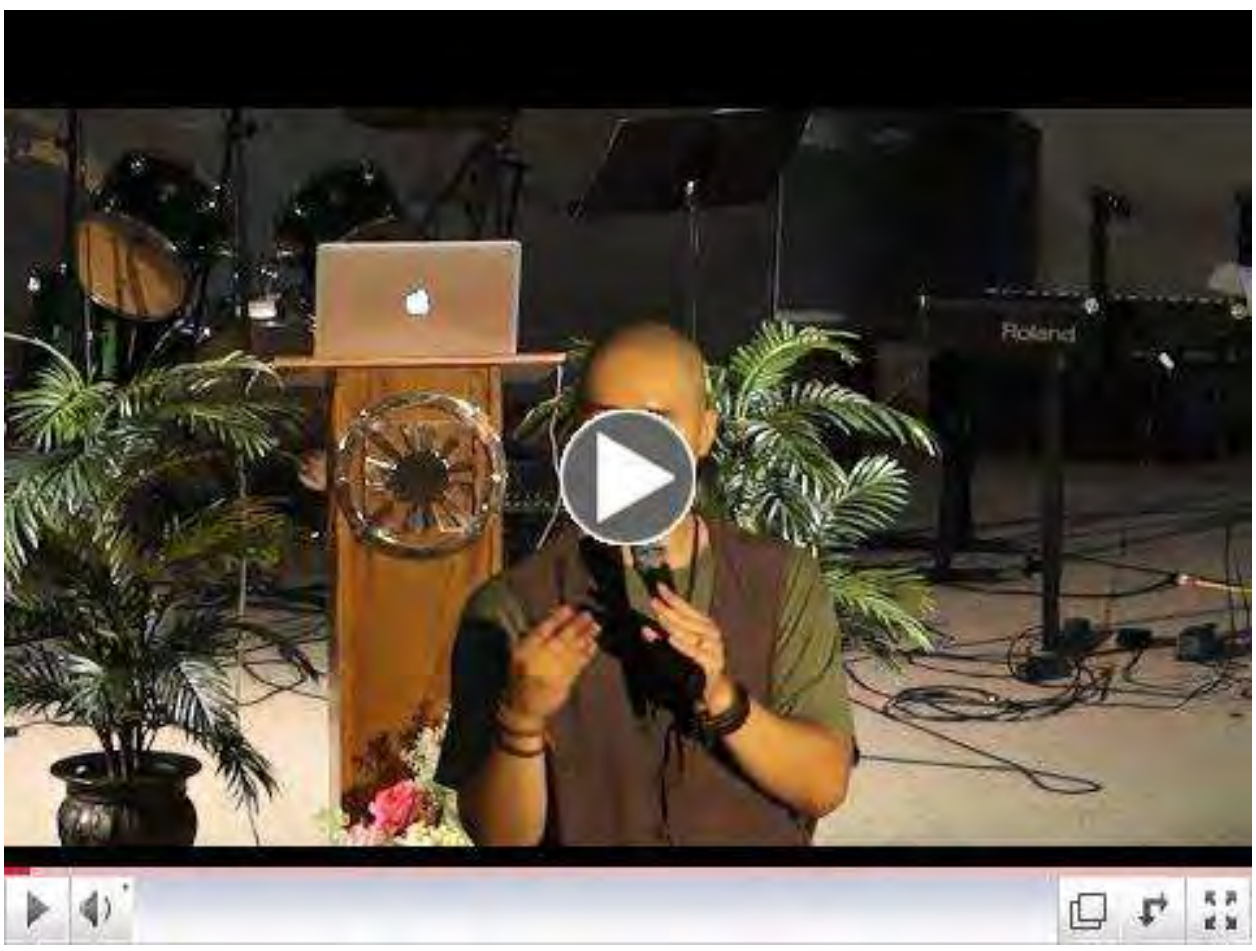
Deep Faith with God

Instead of desperately trying to "pull the weeds" of doubt, he explains, we should GO INTO those weeds with God. Instead of being "addicts" always seeking the "spiritual highs," we should seek a complete relationship with God, which also includes the low points where a fuller experience with God can be encountered.