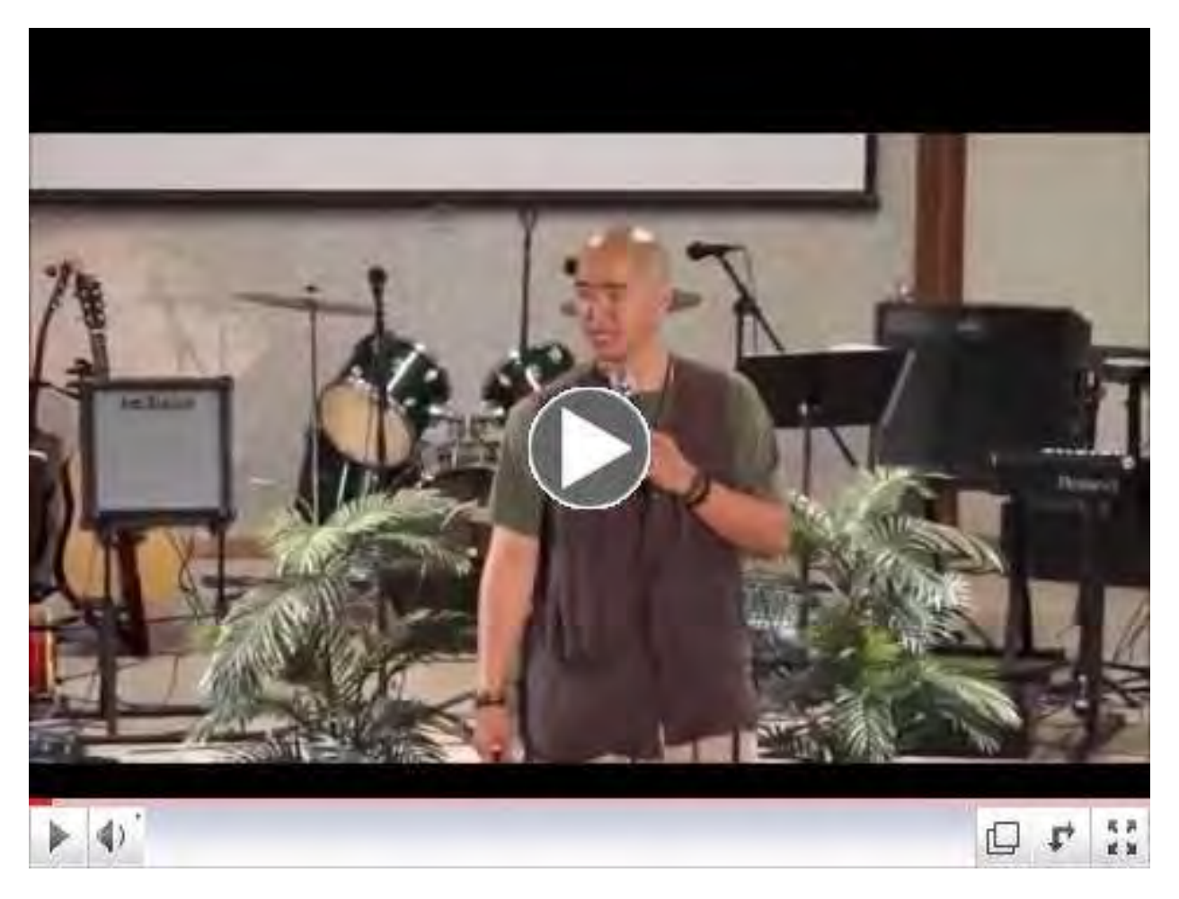
Good Called Evil and Evil Good

It is truly tragic that the worldwide church is compliant with efforts to erase and isolate this precious couple who have so much to offer the Unification Movement. Will you comply with directives not to watch their sermons? Especially if you are a Second Gen BC don't you want to know what a fellow 2nd Gen is doing to carry on his Father's legacy in the face of efforts to silence him?