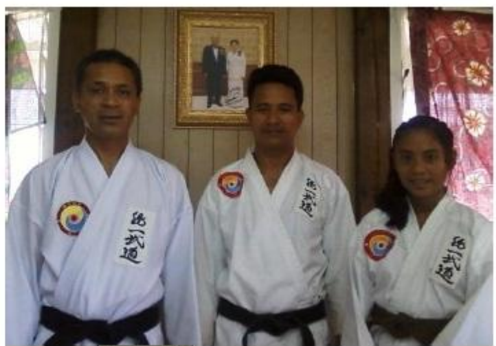
Inauguration of Unification Church in Magiagi, Apia. Tong Il Moo D Photo0052 working at National University of Samoa.