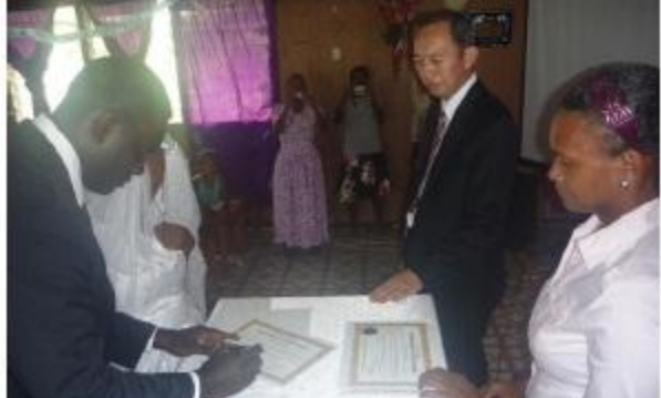
Couples signed the marriage certificates