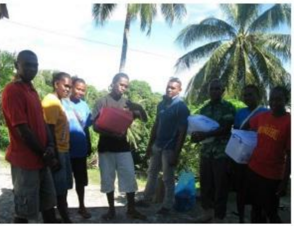
Centre Members' Fundraising