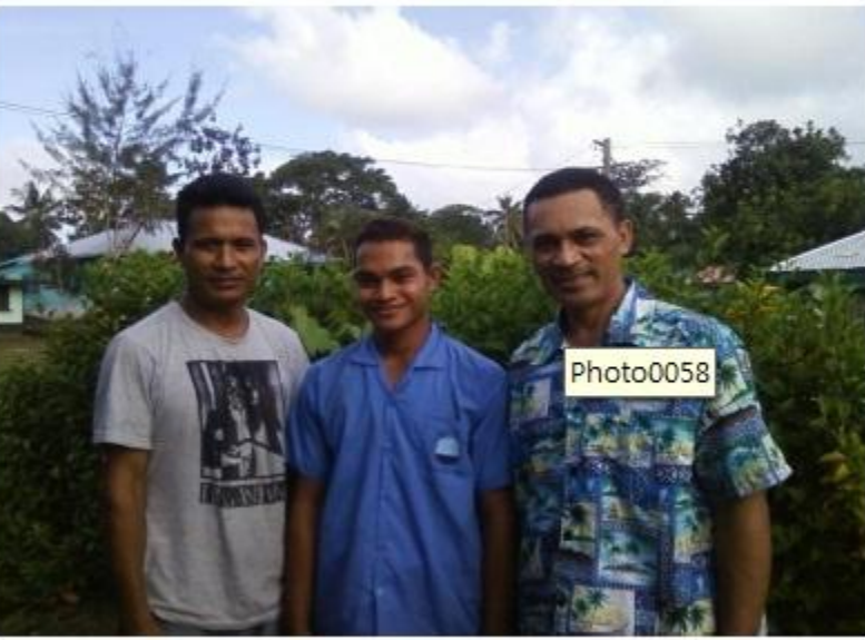
1-day and 2-day Divine Principle workshop for Lamauta&Apineru