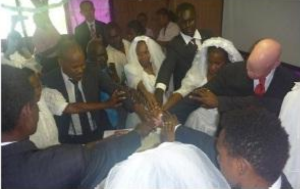
Blessing Cake Cutting