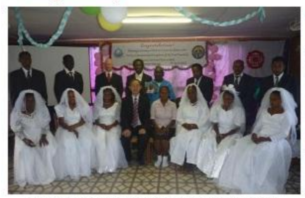
7th April, 7 Couples attended the Blessing Ceremony