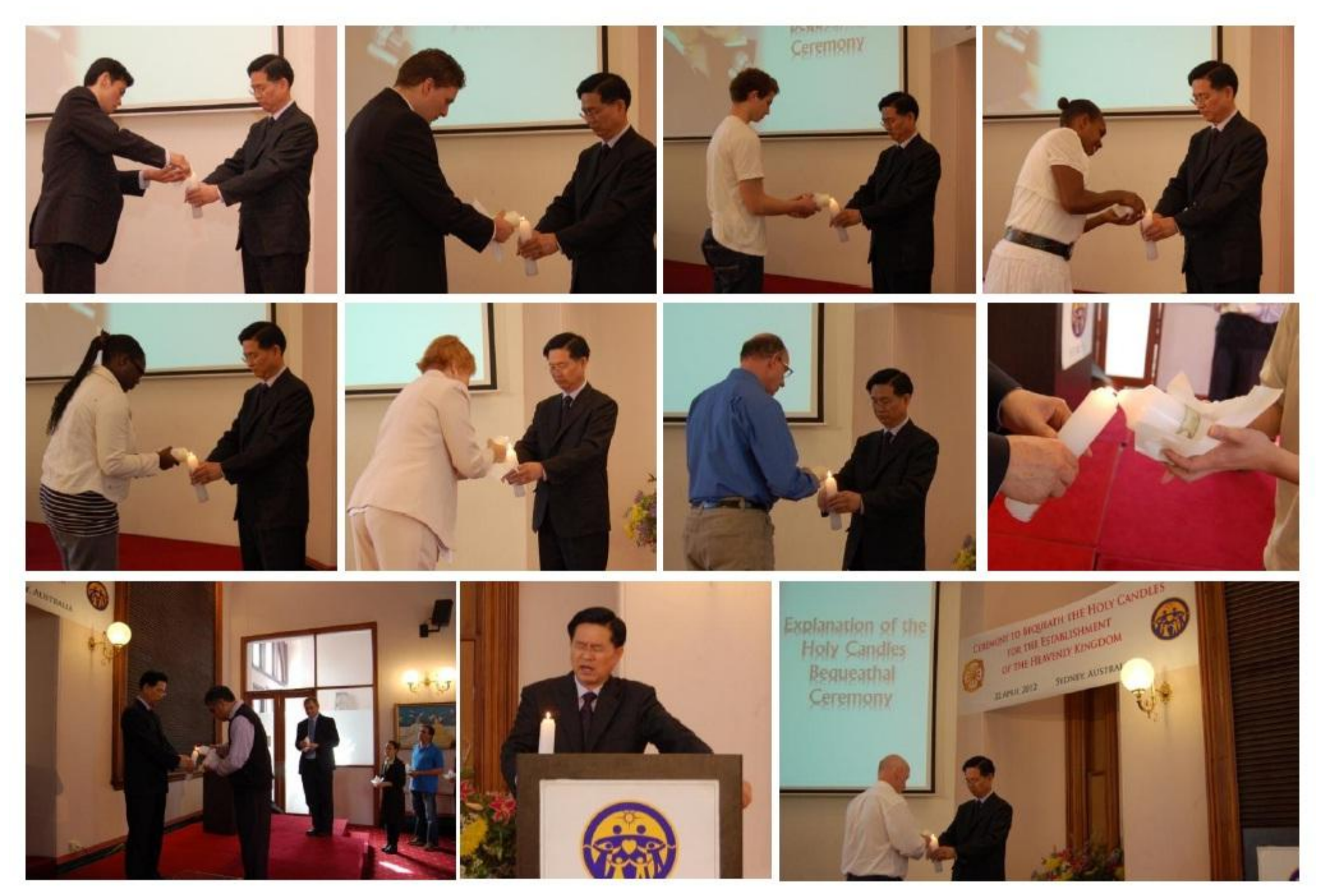
These Holy Candles can be used concurrently with CheonIlGuk candles, particularly in preparation for Foundation Day (13 January 2013 by the Heavenly calendar, 22 February 2013 by the Gregorian/solar