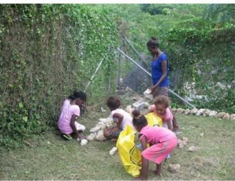
B.F.D helped collecting stones for the Kindergarten (New Hope Academy)