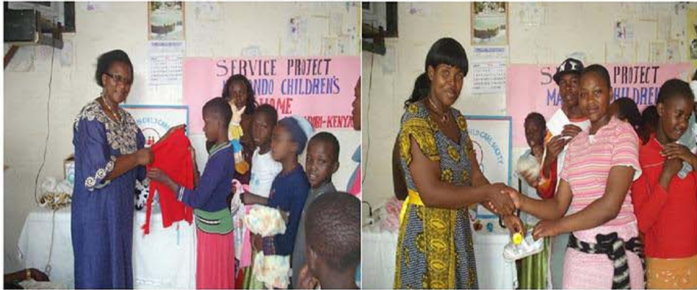
Presentation to the best dancer teenagers' group