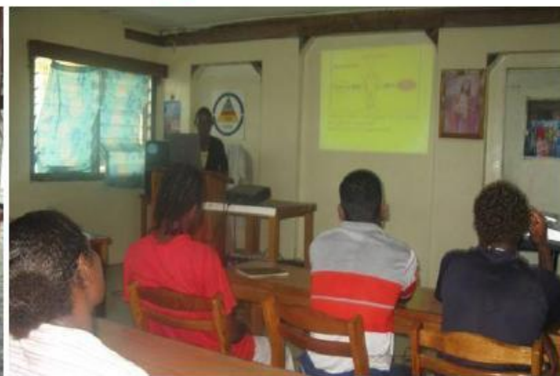
➔ Right: New guests giving their reflections