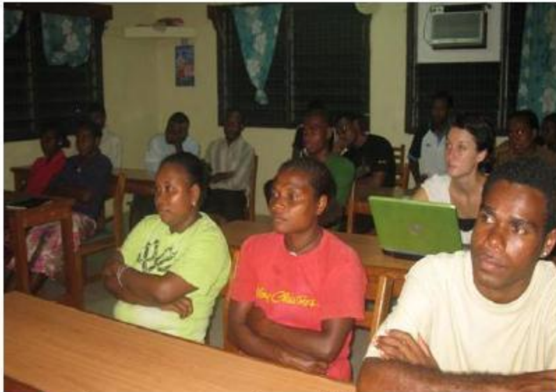
➔ Left: Participants at 3days Workshop

Honiara, Solomon Islands, November 18 st – 20 st , 2011