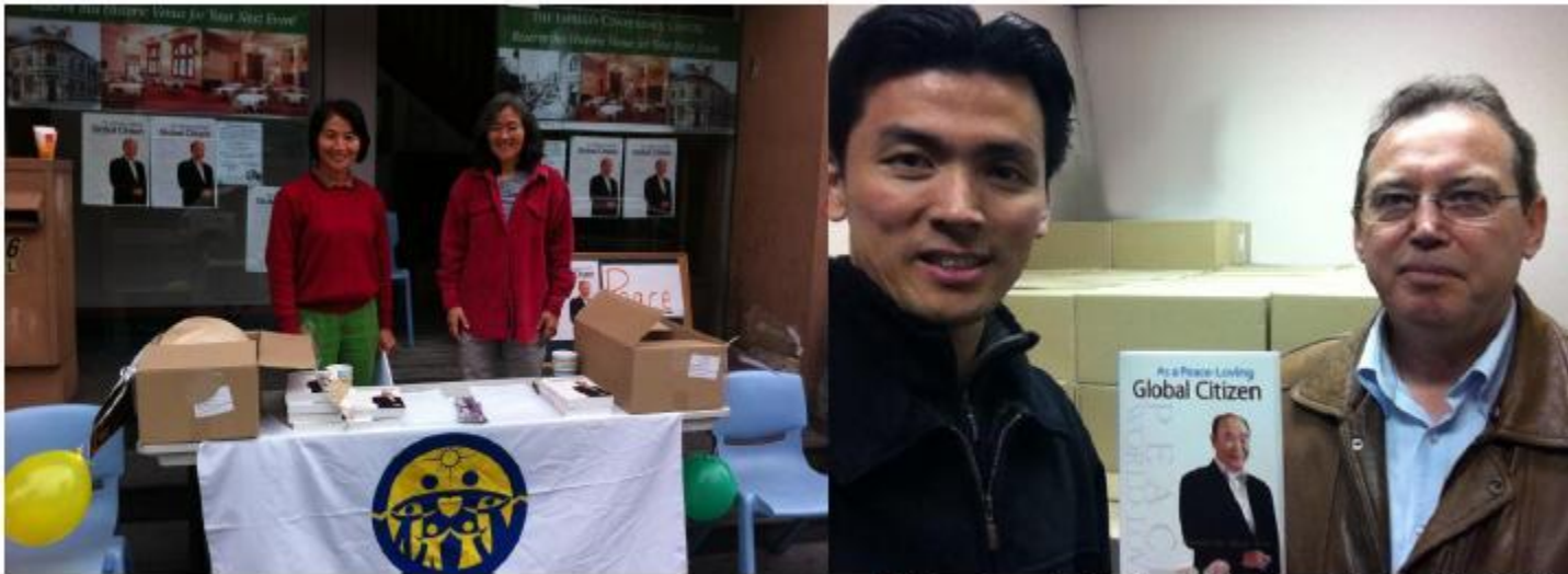
➔ Autobiography Distribution in Sydney.

at a reduced price. This would make it possible for large quantities of the book to be available relatively inexpensively for Blessed Families and members in Australia and Oceania . to be used by them for witnessing and outreach in fulfilment of True Father's directions regarding Tribal Messiahship, especially in preparation for the Foundation Day. Orders were taken, and arrangements made for copyright permission and source text so that eventually there could be a first bulk printing of 10,000 copies of the Autobiography.