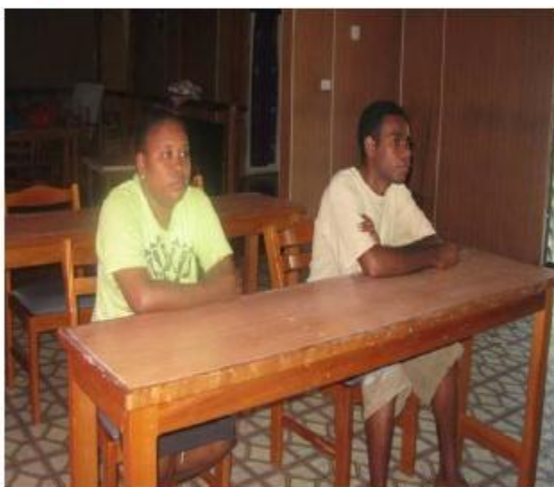
➔ Left: Two guests concluding with Second Advent