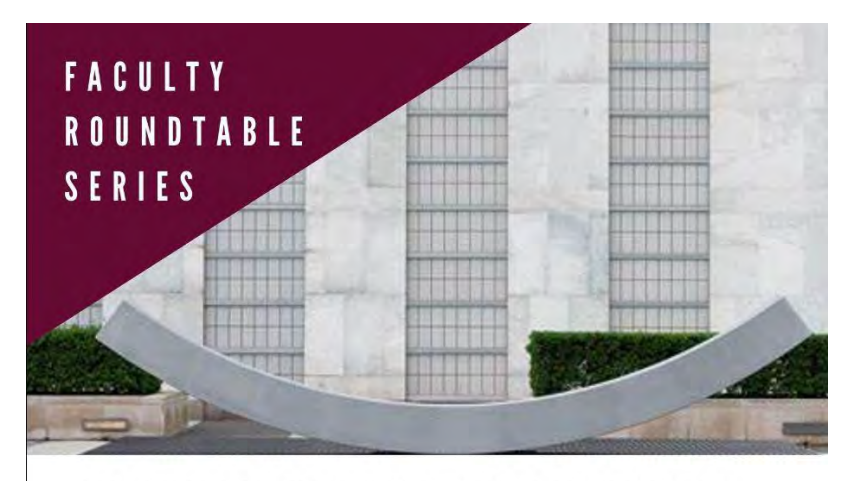
WEDNESDAY | SEP 30 | 5-6 PM EDT