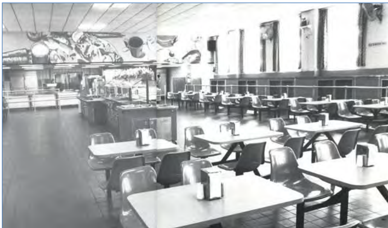
The prison cafeteria. Every morning, Father sets up the salt and pepper shakers and the napkins.

Question: You were asked to make arrangements for visitors who want to meet with Father at Danbury. Can you describe your task there in more detail?