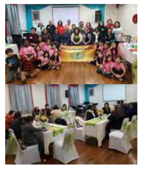
TABLE TALK: HOW WOMEN ARE PORTRAYED BY MEDIA

Hollywood movies, television shows and advertisement campaigns all have something in common: their misrepresentation of women. This may have something to do with the fact that the majority of them are written, directed and produced by men. As a powerful tool of influence in society, media is a relevant topic that needs to be addressed.