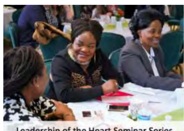
Leadership of the Heart Seminar Series

"The seminar was inspiring, uplifting and interactive. There were so many areas of the seminar that moved me, such as the meditation component. For a few minutes, I could go deeper within and connect to the divine, higher self and find peace. The presenters gave us the opportunity to understand more about the Leadership of the Heart and our own inner spirituality; that we are already divine beings, the