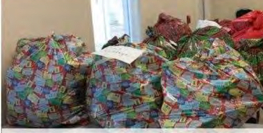
Items collected for families in need by WF Paterson, NJ

- Realizing that the United States is still very much blessed, the WFWP chapters have consistently been raising money to support less fortunate women, children, and families around the world. In addition to 9 local Schools of Africa fundraisers and a generous anonymous donation for the school in Senegal, this year WFWP USA collaborated with WFWP Jordan to raise funds for the Arabic Literacy Project. Thanks to many generous donations, we were able to send $7,000 to support supplemental literacy classes for refugee children living in Jordan.