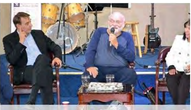
Panelists sharing on the unity of the two Koreas in Ore