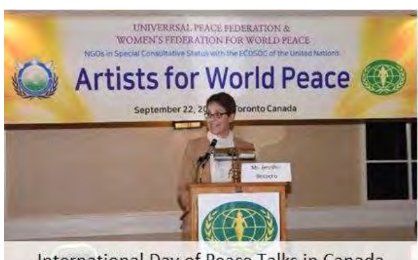
International Day of Peace Talks in Canada

- As part of an international organization in General Consultative Status with the Economic and Social Council of the United Nations, we take pride in supporting United Nations efforts. This year, five chapters commemorated the UN International Day of Peace highlighting different avenues to bring about peace, and the reunification of North and South Korea through dialogue and panel discussions. Six chapters also commemorated the UN International Women's Month with programs and discussions on women's role in building peace.