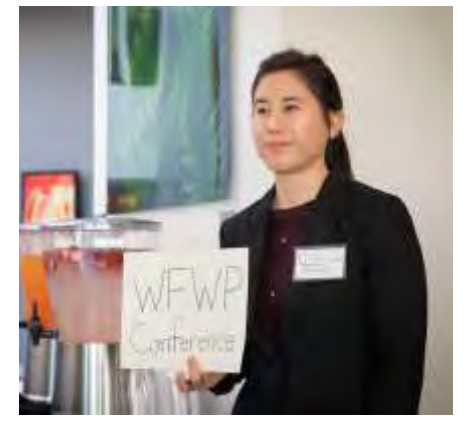
WFWP staff welcoming attendees of the dynamic Global Women's Peace Network conference in NYC.