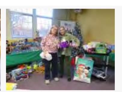
Service to communities