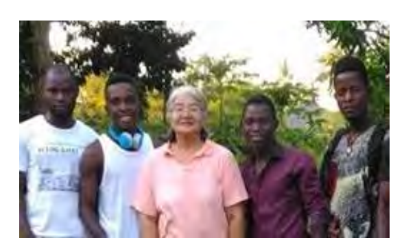
Graduates of WFWP school in Mozambique with volunteer teacher from Japan.