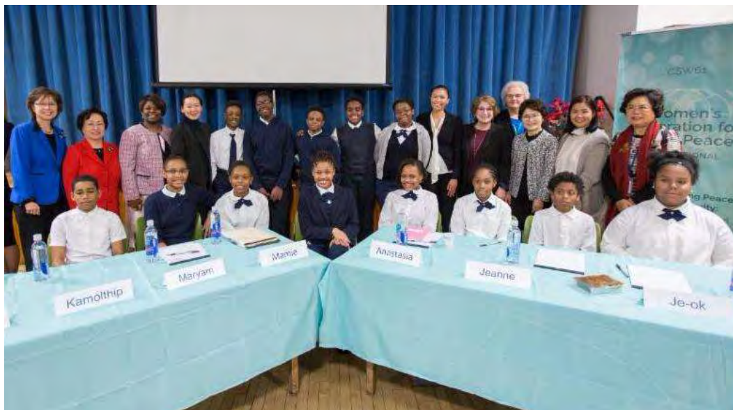
Young students from Macademy Middle School in Brooklyn participate in the WFWPI UN Parallel Event "Women Fostering Peace and Co-prosperity: Intergenerational Collaboration Sans Arrogance"