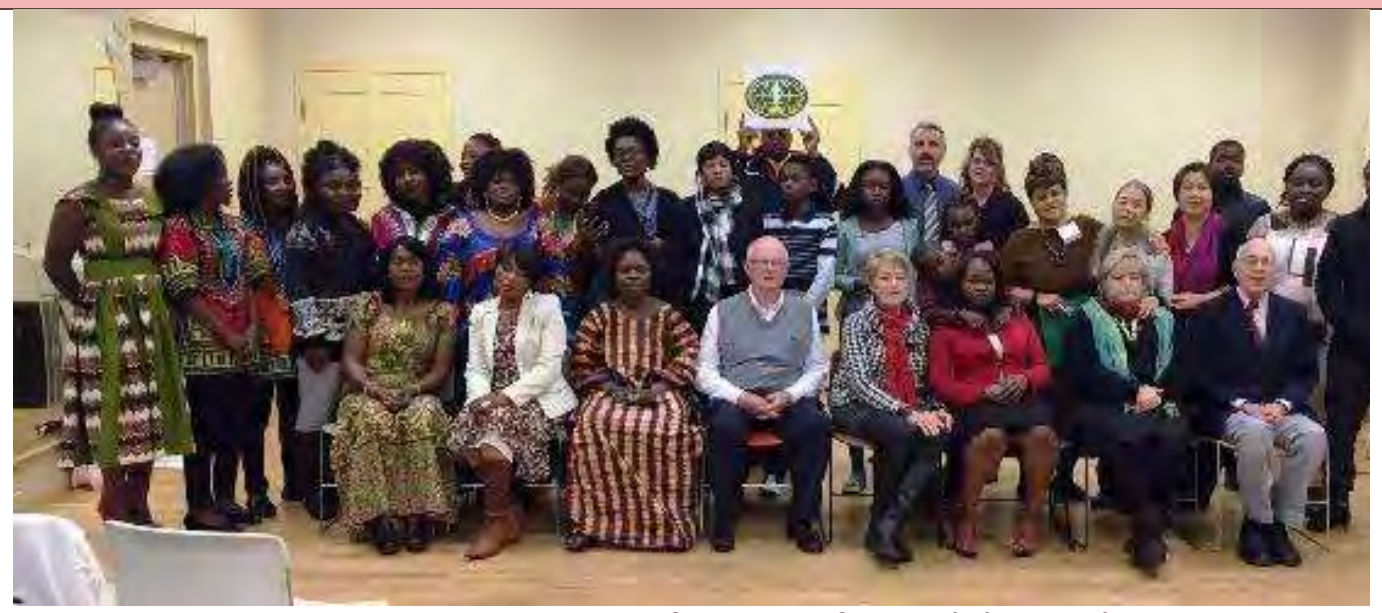
Participants and Presenters at the Grand Rapids Schools of Africa Benefit