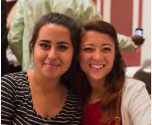
Membership Assistant Intern

Are you a passionate, creative individual seeking to apply your skills toward making the world a better place? Looking for hands-on experience working in an international non-profit organization?