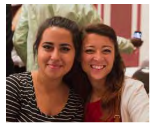
Membership Assistant Intern

Are you a passionate, creative individual seeking to apply your skills toward making the world a better place? Looking for hands-on experience working in an international non-profit organization?