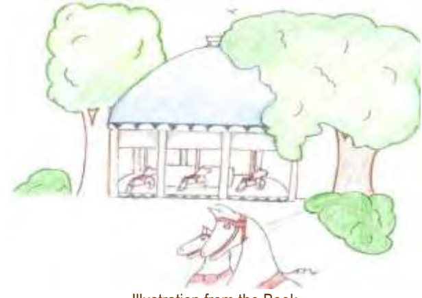
Illustration from the Book

[Editor's Note: Additionally, if you buy it with Amazon Smile through the WFWP website, WFWP will also benefit from this lovely book.]