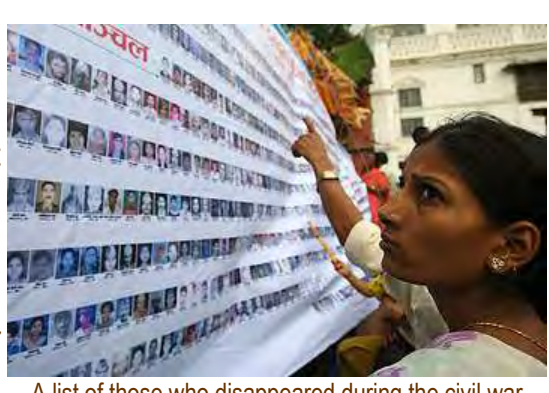
A list of those who disappeared during the civil war

by the British Empire as was the case with many of its neighbors? Is it predominantly Muslim like Pakistan and Bangladesh, predominantly Hindu like India, or something else?