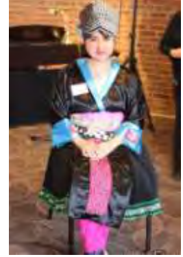
Hmong traditional dress

Then, as she spoke about her trip to Laos, she discussed her life there before coming to America. She spoke of how the Hmong People in Laos continue to live in poverty and she outlined the history of suffering of the Hmong people. Some of her experiences on her trip to Laos included meeting young high school girls that were already prostitutes, boys that walked