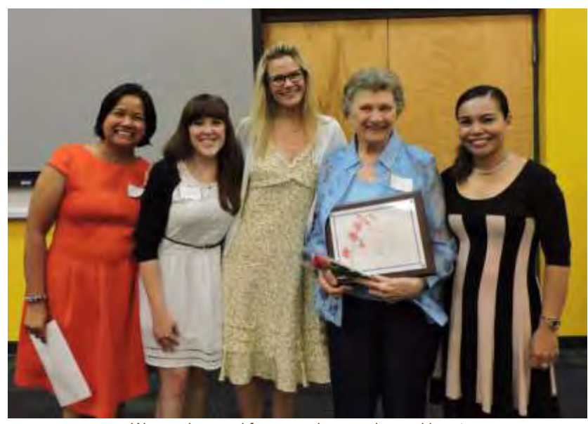
Women honored for exemplary service and heart