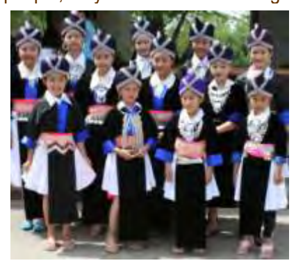
Contemporary Hmong in America

On February 7th, several members from the Minneapolis WFWP chapter attended a workshop given by the Hmong Nationalities Organization (HNO). For those of you who may not be familiar with the Hmong people, they are a distinct ethnic group with ancient roots in China. They