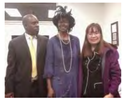
Smiling together after the speech

community leaders and council members, I was so anxious and had no confidence. But, as I was giving my speech I felt strong energy coming to me. I felt the founding spirit of WFWP cheering me on. I felt proud that I could represent the great and valuable gift that is within WFWP. With that strength I introduced WFWP to those assembled.