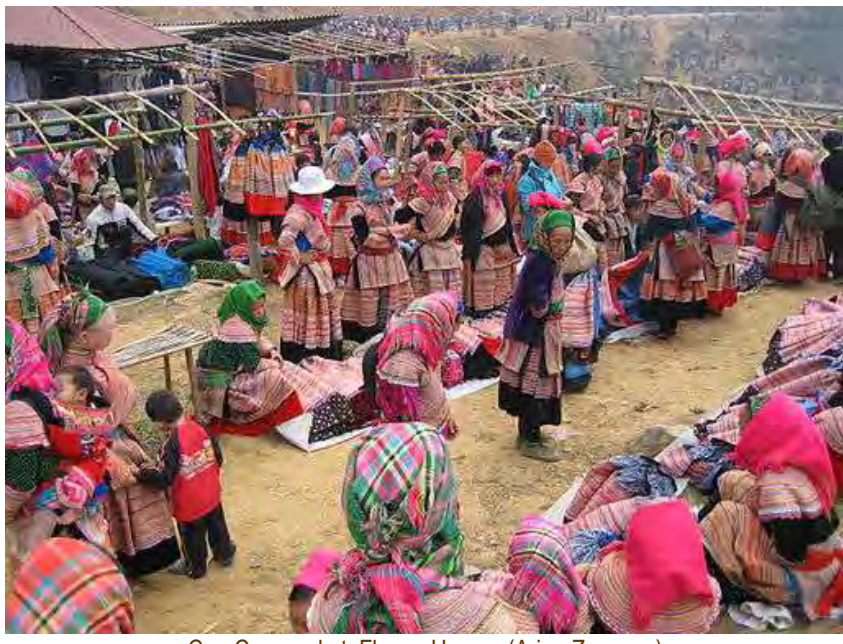
Can Cau market, Flower Hmong (Arian Zwegers)