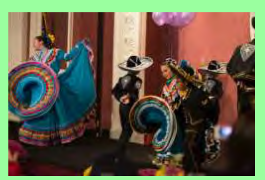
Quetzaldiosa Folklore Dance School