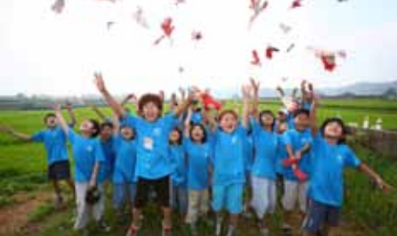
The WFWP Korea Peace Unification Camp is aimed at helping children realize the importance of Peace and Unification of the Korean Peninsula, and help them participate in the peacebuilding process. WFWP has organized the camps which are sponsored by Korea's Ministry of Unification, for the last ten years. Camps are held during summer vacation.