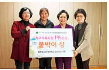
1% Love Share Project - Support for Kim Jong-suk Nursery School in Pyongyang