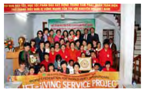
Women Peace Academy Service Projects