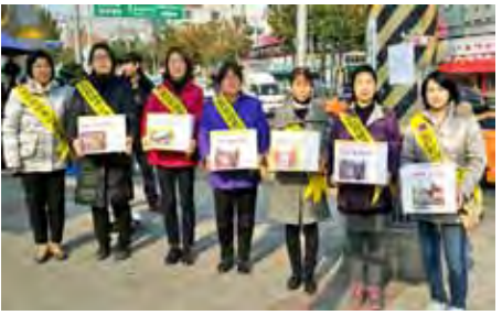
Fundraising for Philippines' Typhoon Victims