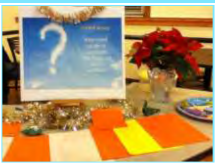
Poster and survey table attracted participants

Click here to continue: wfwp.us/national/ohio/columbus-chapter-conducts-survey