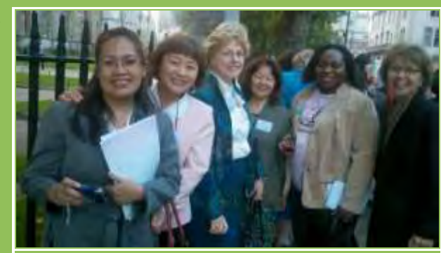
Informal Photo of most of USA Team in London

Coincidentally, the location of this conference was just a half-mile from the British Museum, where Karl Marx wrote