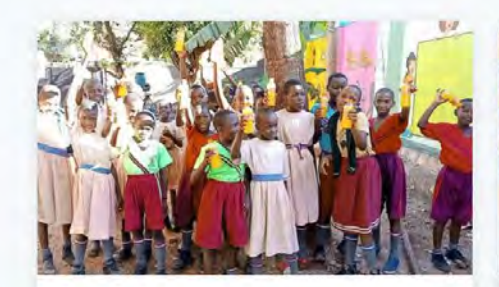
Become a Destiny Junior School Donor for £10 a month