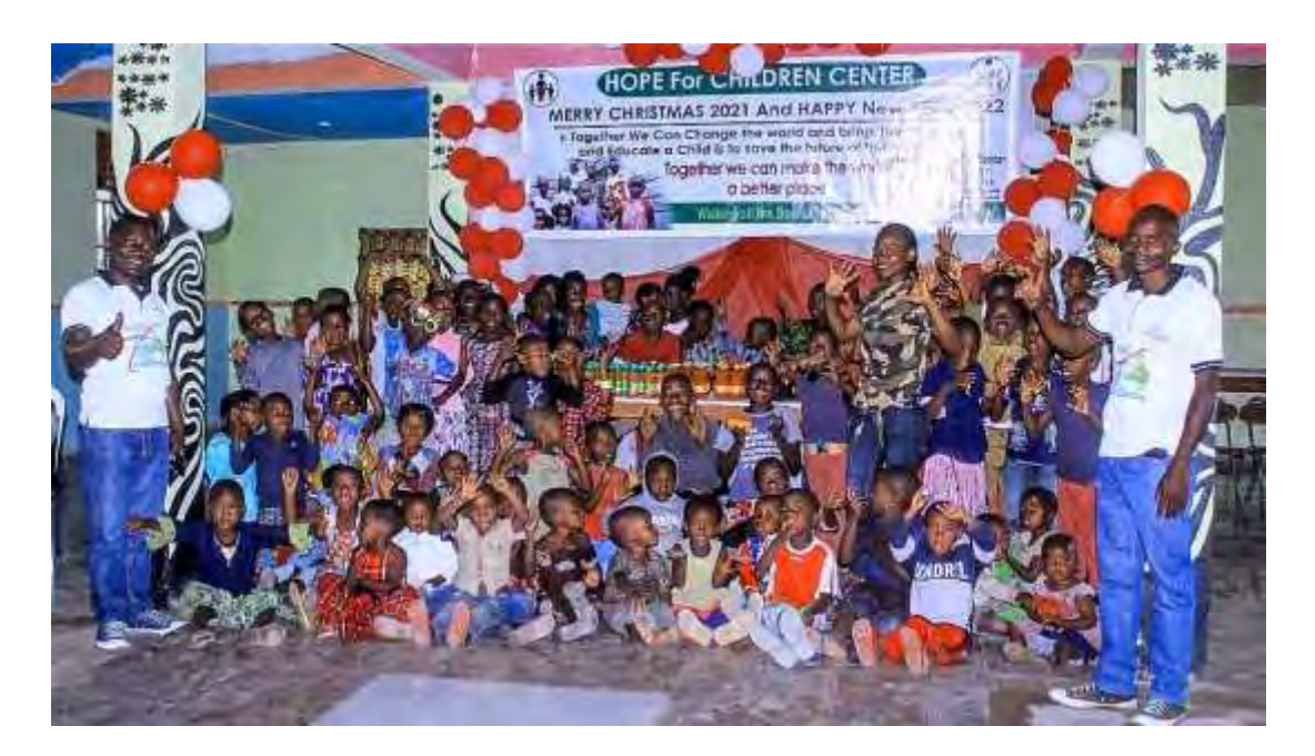
IRFF UK funded 'Hope for Children' Christmas and New Year Celebration, 2021

Since late 2021, M23 rebels have seized territory in North Kivu province and neared the regional hub of Goma, prompting hundreds of thousands to flee their homes (<u>Rédaction Africanews</u>, 2023). The children were caught up in the midst of this and it has thus been a struggle to keep the children together and happy.