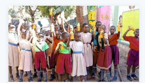
Become a Destiny Junior School Donor for £10 a month