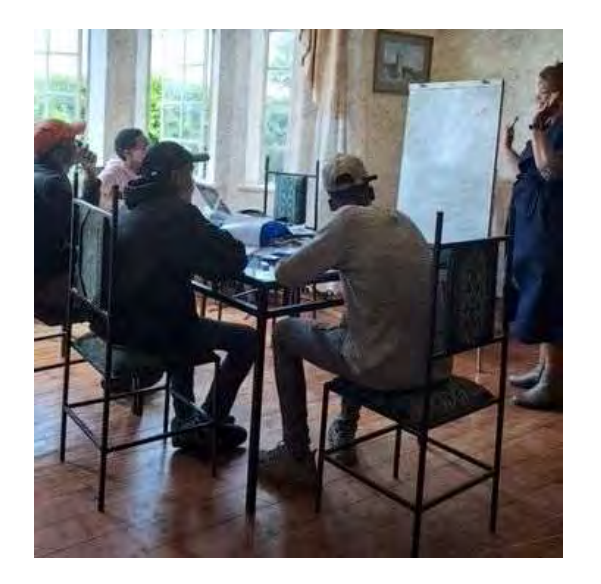
Slovo Study Group during boot camp, getting support with their maths and science

The Slovo Study Group are currently focussing on preparing to run another boot camp, for which they will need funding to pay for venue, tutors and food.