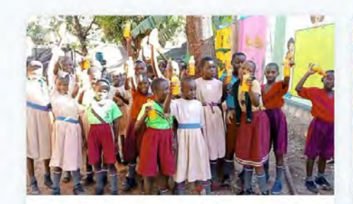
Become a Destiny Junior School Donor for £10 a month