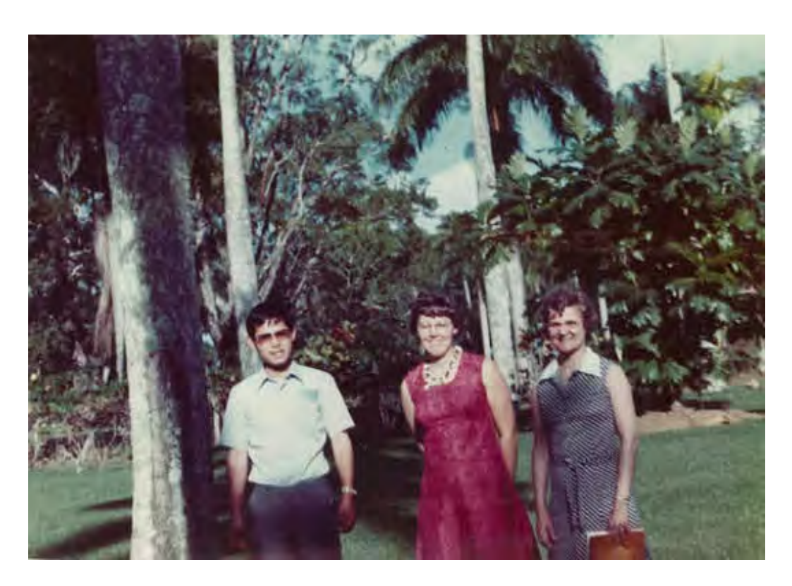
A pledge to Heavenly Father for the victory in Fiji and three shouts of "Monsei!" concluded the ceremony.