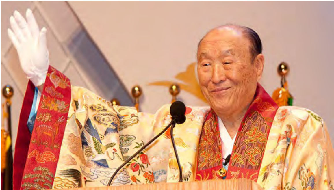
January 13, 2009 New York, NY, United States