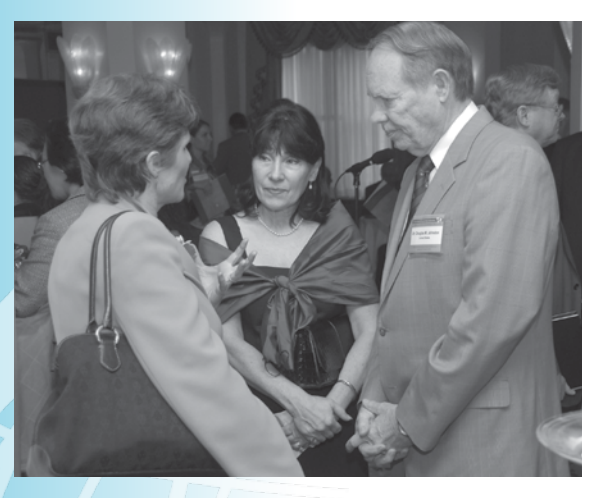
Presentations at the International Leadership Conferences sparked lively discussion.

"Christian religious leaders came up to me with smiles on their faces. They said, 'You know, this is the first time we have ever been heard."