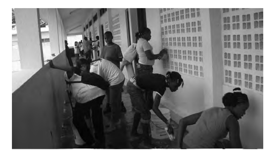
Students clean a school in St. Lucia