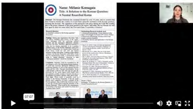
Mélanie Komagata, Student in the Master of Arts in Religious Studies Program A Solution to the Korean Question: A Neutral Reunified Korea