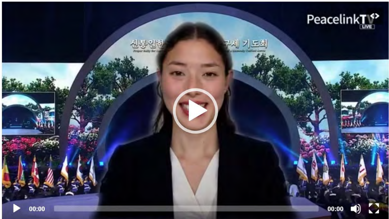
The highlights video