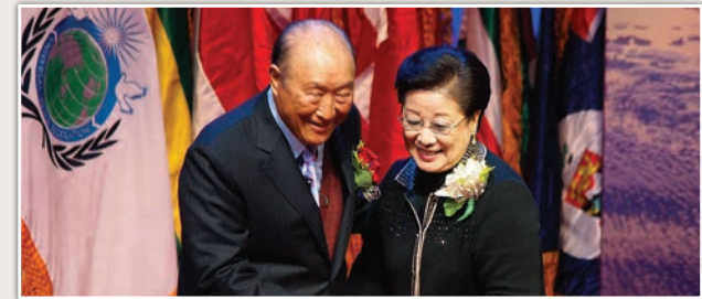
Rev. Dr. Sun Myung Moon and Dr. Hak Ja Han Moon Founders, UPF International