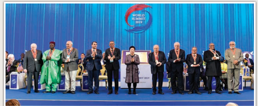
World Summit 2019. Seoul, Korea, February 8, 2019

International Leadership Conferences, symposia, and peace councils offer opportunities for capacity-building among leaders from all sectors. Peace and security considerations are complemented by “track two” diplomacy and grass-roots programs that build support for a culture of peace.