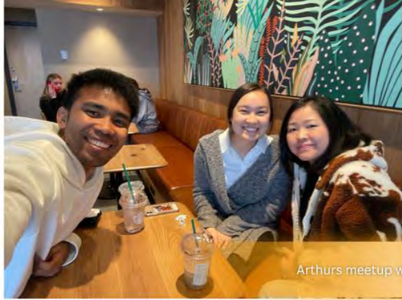
Arthurs meetup with Onka!