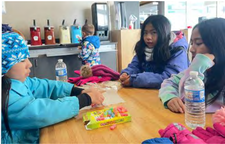
Shine City Project distributes food at Cortney Junior High School with The Just One Project - January 20, 2024!