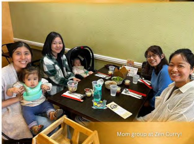
Mom group at Zen Curry!