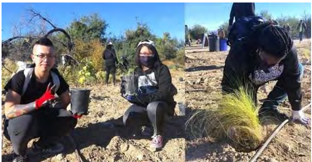
On November 4, 2023, Shine City Project participated in the Warm Springs Natural Area Green-Up! Our eleven Shine City Project volunteers made a one-hour drive to Moapa where we joined a hundred others in revegetating a couple acres of the Warm Springs Natural Area. There were young western honey mesquite trees and other native plants