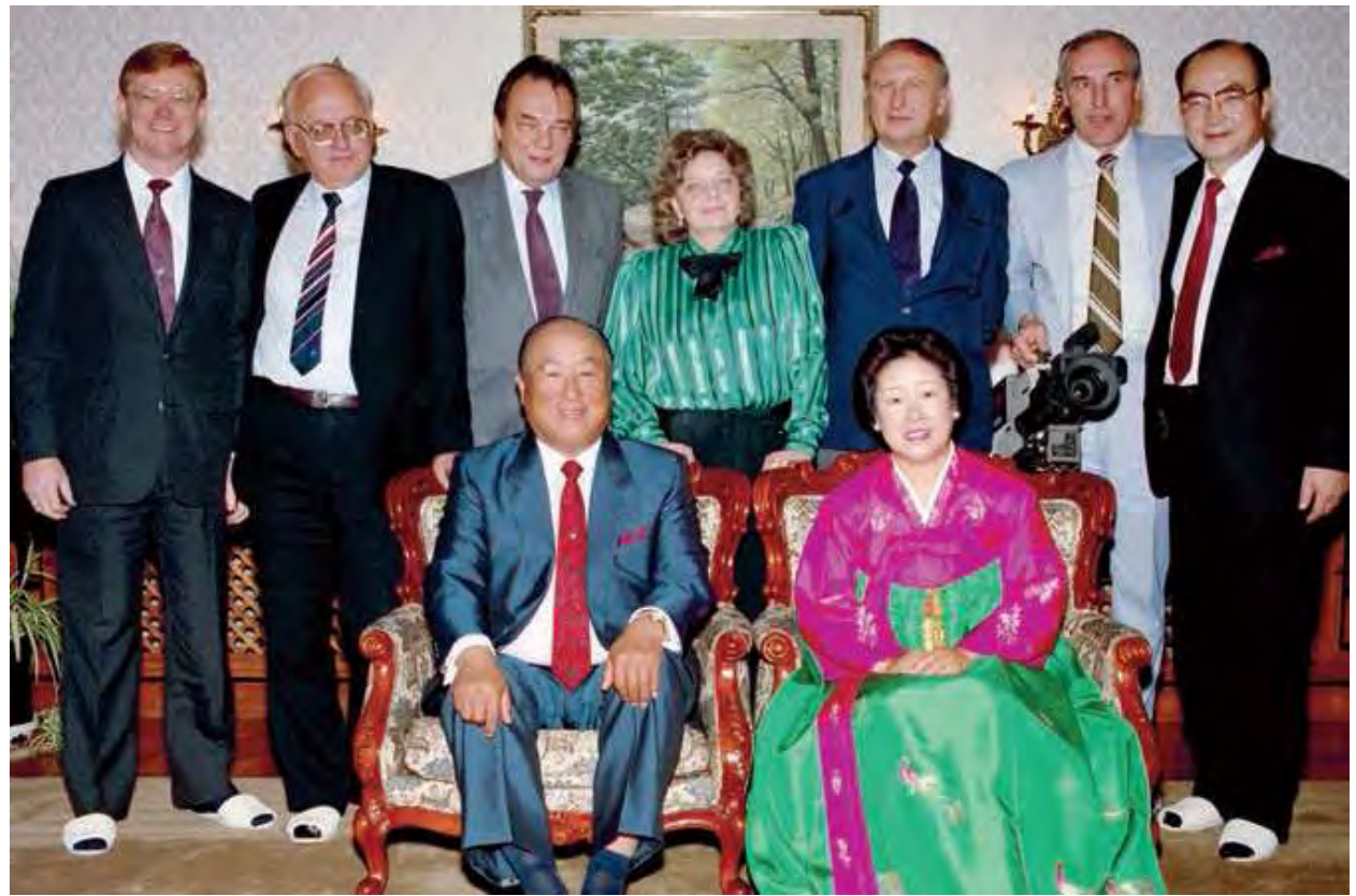
Members of the Soviet press with True Parents

There they discussed methods of bringing about world peace. True Parents also brought about rapid providential development through important proclamations during their time at Hannam-dong: