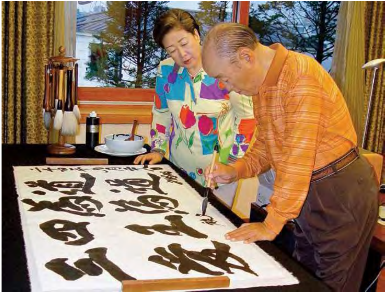
At the Hannamdong house, True Father wrote, "The path for the sake of the three great kingships and four-position foundation is the path to love the king."

members listening to testimonies. Particularly when Hoon Dok Hae officially started in 1997, many members came to hear True Parent speak.