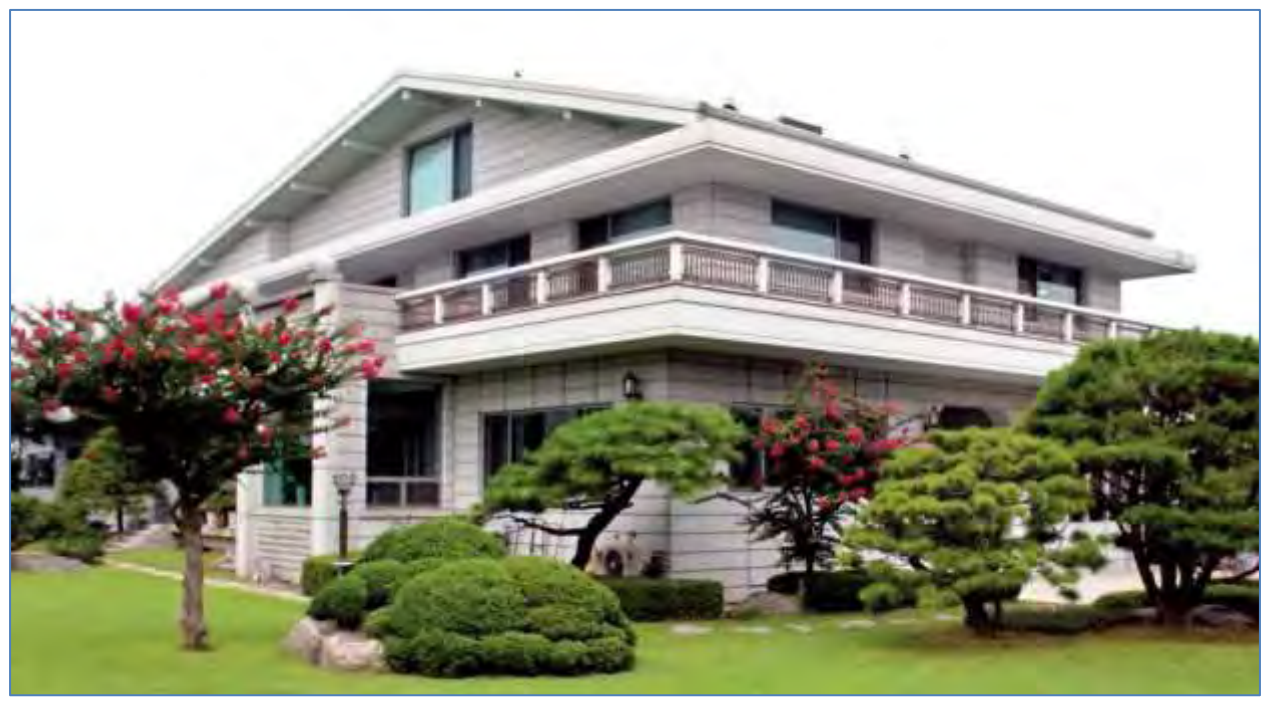
Hannam International Training Center and Guesthouse