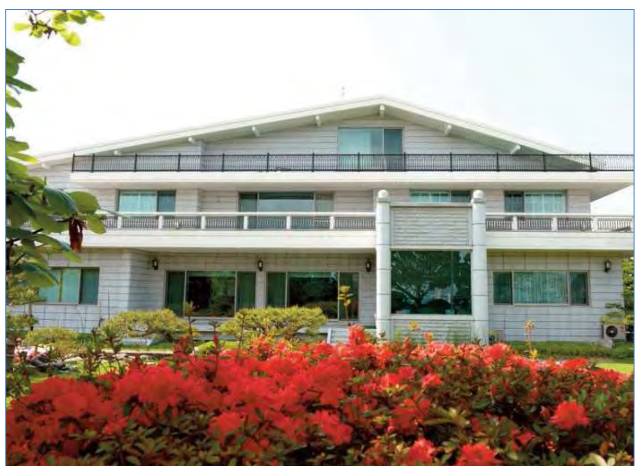
The front of the Hannamdong house