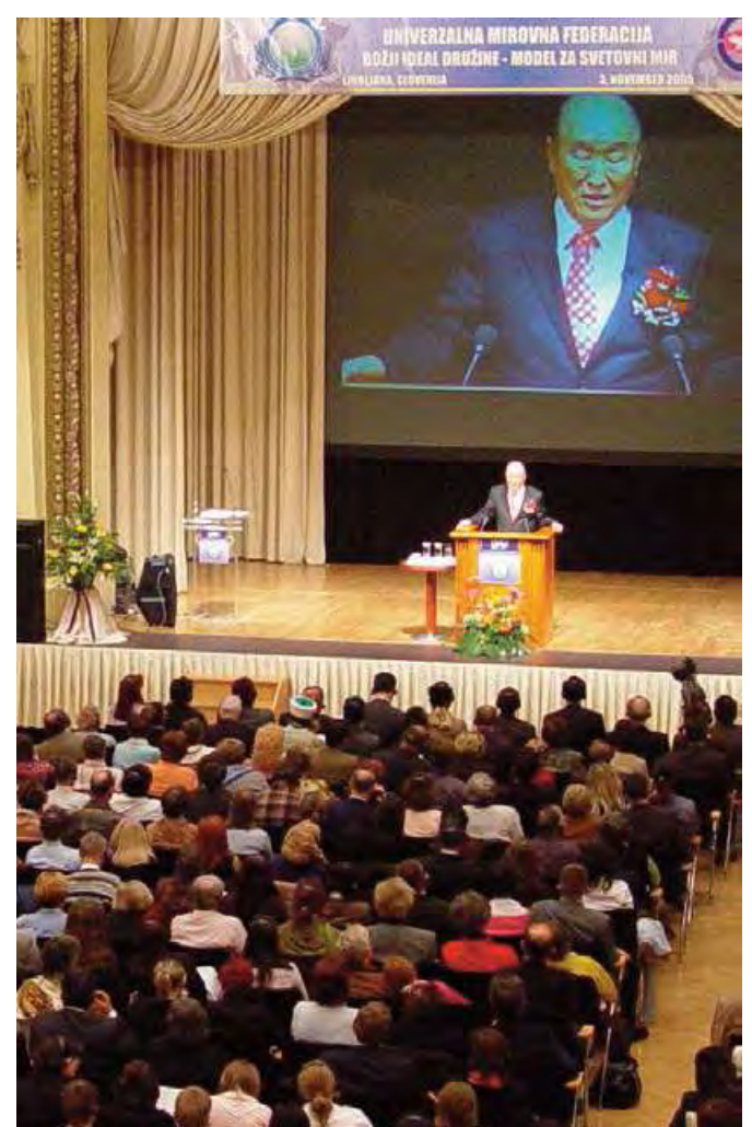
2005 True Father in Slovenia to found UPF