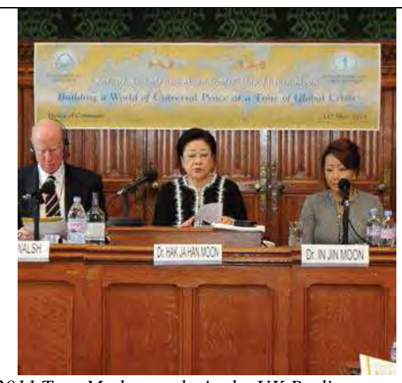
2011 True Mother spoke in the UK Parliament building