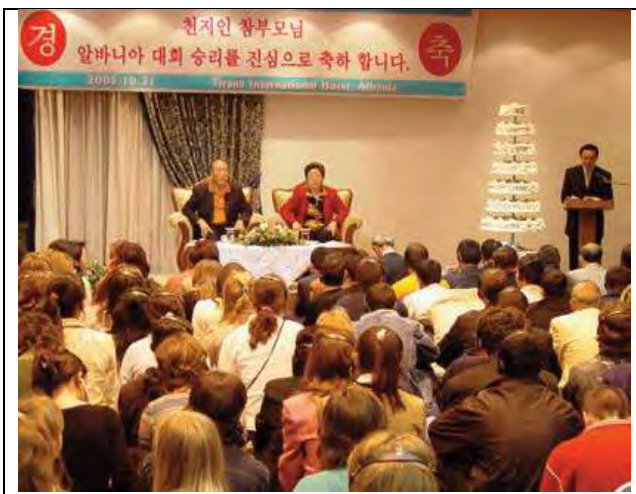
2005 Albanians celebrate UPF's founding

In Switzerland, a permanently neutral state, True Parents stayed for quite a while in 2005 and 2006, where they delivered a speech at the United Nations' Geneva Headquarters offices and offered devotions in the Alps. In addition, Switzerland is a blessed land where, after the declaration of the Foundation Day of Cheon II Guk in 2013, True Mother offered devotions on Alpine peaks. Gathering the resolve of all Unification Church family members worldwide for success in Vision 2020, True Mother offered devotions at the summits of twelve mountains. Her prayers for world peace and the salvation of all people, which echoed throughout the Alps, became the driving force behind activities in the Cheon II Guk era that are now being led by European members.