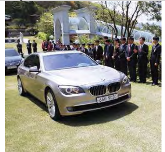
2015 True Mother leaves for Europe on April 28 to honor fifty years of European work