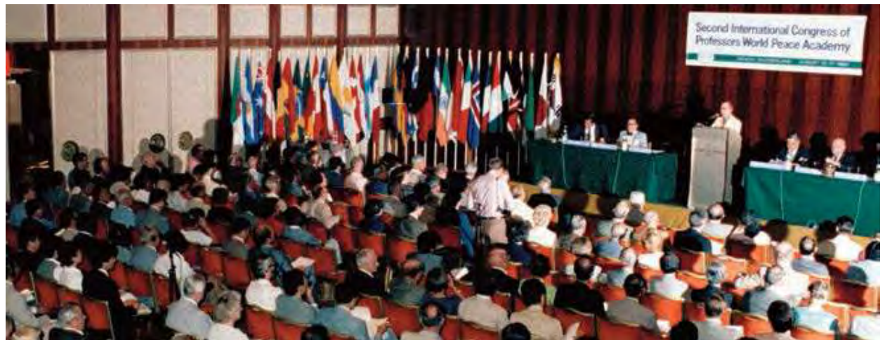
1985 Geneva, Switzerland, Father had given PWPA the conference theme "The Fall of the Soviet Empire: Prospects for Transition to a Post-Soviet World."