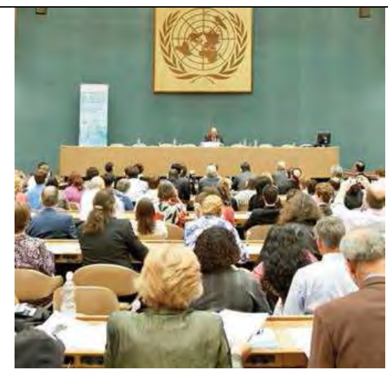
2011 True Father speaking in the UN Office at Geneva