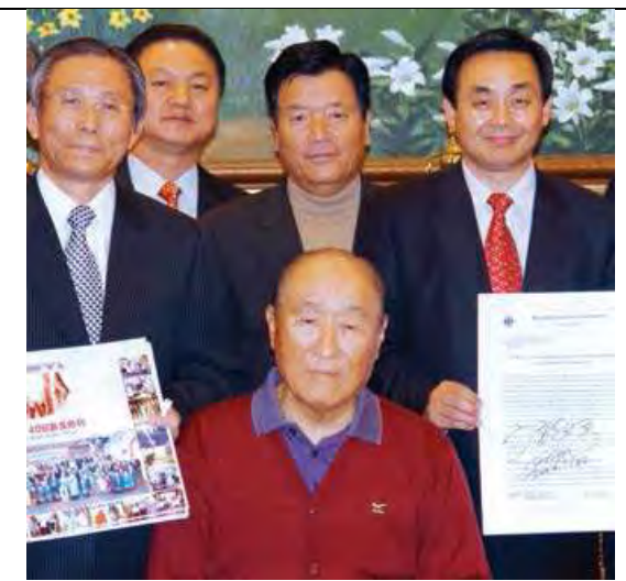
2007 The Schengen ban was lifted