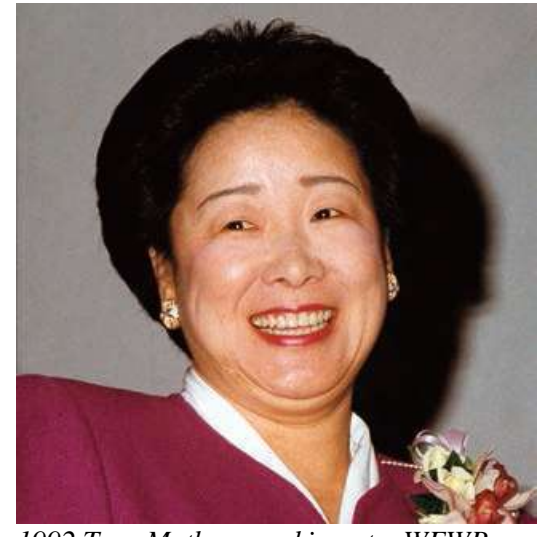
1992 True Mother speaking at a WFWP founding convention in London

1985, eleven nations in Europe signed the Schengen Agreement to break down national boundaries and make it possible for their citizens to travel between these nations without a passport.