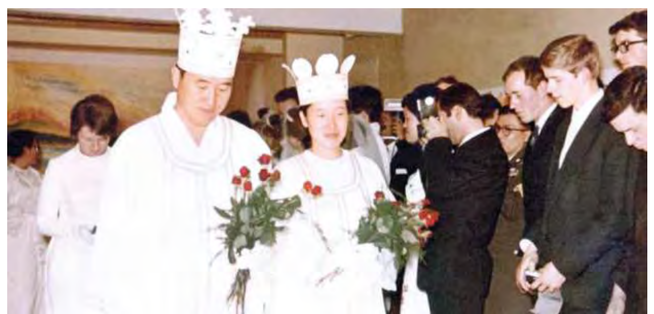
1969 officiating the Blessing Ceremony of eight couples, March 28 in Essen, Germany

in the Soviet Union began. Unknown to others and without receiving glory for their efforts, they faithfully carried out their work. These dazzlingly beautiful butterflies will be remembered in the history of God's providence, shining in eternal glory.