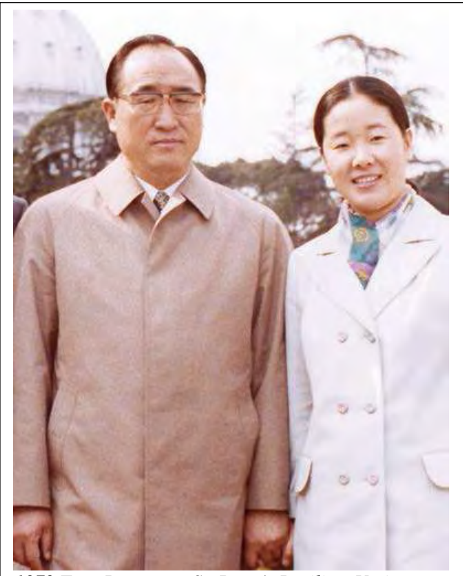
1972 True Parents at St. Peter's Basilica, Vatican

True Father speaking of missionaries to communist countries, April 30, 1990