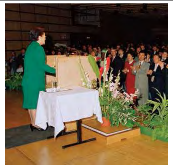
1996 True Mother speaking in Austria on the global tour to establish FFWPU internationally.

then had been broken down. Following that, in 2009, we held the Peace Cup football tournament in Spain and in 2011 True Father proclaimed the Word as God's Substantial Self, despite the strain on his health.