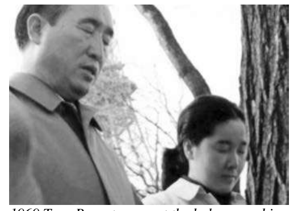
1969 True Parents pray at the holy ground in Paris, France.

He toured Europe for about forty days from the first city they visited, Lisbon in Portugal, to the Vatican, and established nineteen holy grounds in sixteen nations.