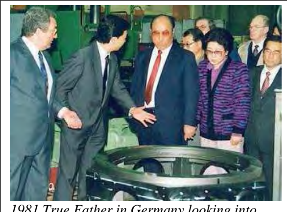
1981 True Father in Germany looking into machine tool manufacturing

European members offered devotions devoutly, which wrought miracles. After eighteen successive fortyday conditions had been offered during two and a half years throughout Europe's thirty-five nations, the United Kingdom, which had been the first nation to deny True Parents entry, finally granted them permission to visit.