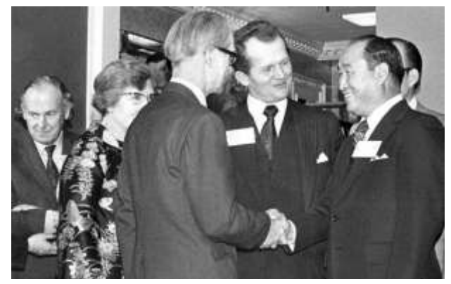
1974 the third International Conference on the Unity of the Sciences

During the Cold War, the easiest route to Eastern Europe was through Vienna.