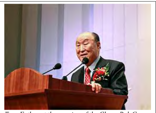
True Father at the opening of the Cheon Bok Gung

True Parents dedicated the Cheon Bok Gung, or "Unification Peace Temple," on February 21, 2010. In 2008, True Father had called for the establishment of a 20,000-member church in Seoul that would serve as a platform to influence the nation. He later increased the goal to a 210,000-person congregation that would influence Korea and eventually the world, not just socially and culturally but also spiritually. Efforts to construct a "growth-stage" Cheon Bok Gung began in earnest with the acquisition of a large public building in Seoul's Yongsan district. The church's worldwide membership, led by Japan and Korea, donated nearly $100 million for the purchase and subsequent renovation costs. This was completed in early 2010, and Unificationists undertook an hour-long march from the previous church headquarters to the new sanctuary, which also would serve as International and Korean Church headquarters.