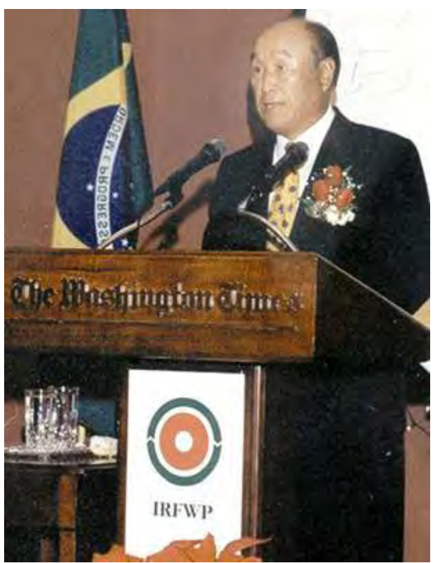
True Father speaks at the IRFWP conference

religious assembly, or council of religious representatives, within the structure of the United Nations" less than two years later at Assembly 2000.