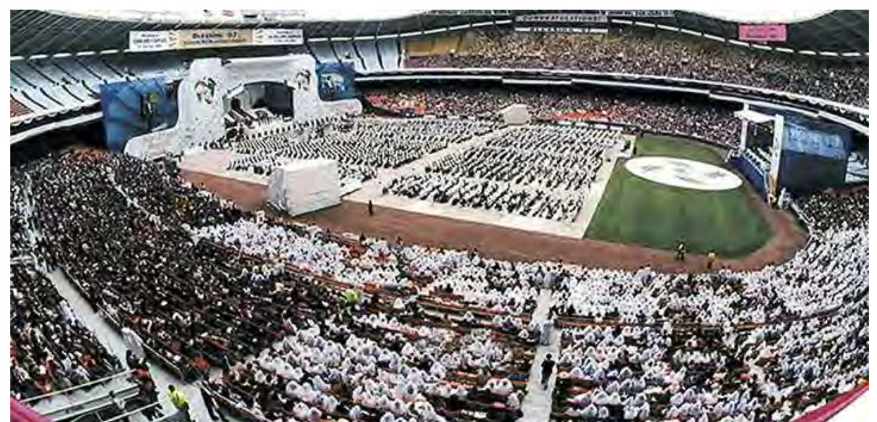
An aerial view of the 3.6 Million Couple Holy Marriage Blessing