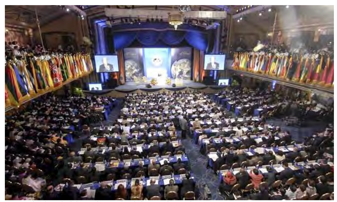
True Father launched the "Substantial" Abel UN at the Manhattan Center.

Conducted at the Manhattan Center, the inauguration brought together representatives from 192 nations seated at UN-styled conference tables. Flags and regalia added to the atmosphere. In his three-hour keynote address, augmented by extemporaneous comments, True Father referred to UPF as "an Abel-type counterpart to the UN" and to the new initiative as the "Peace UN." He expressed hope that it would "lead the way for millions of Ambassadors for Peace throughout the world ... to fulfill the heavenly will of creating 'One Family under God." Finishing at 11:00 p.m., True Father penned an approximately thirty-foot calligraphic message that read in Chinese characters, "May the Sovereignty of the God of True Love, the Sacred Reign of Peace, Last Forever." He then struck a giant gong, sealing the evening's proceedings.