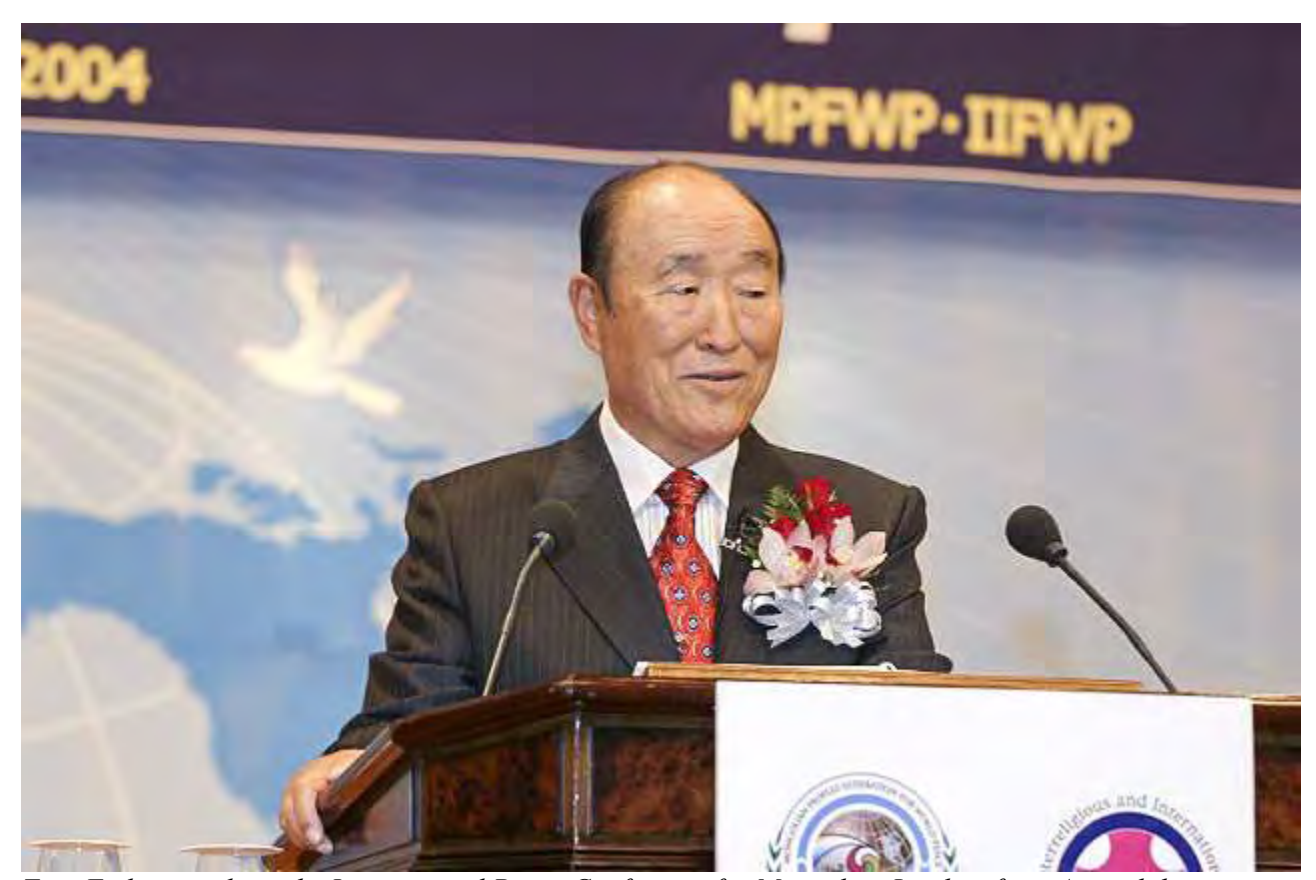
True Father speaks at the International Peace Conference for Mongolian Leaders from Around the World.

September 21, 2004 Inauguration of Mongolian Peoples' Federation