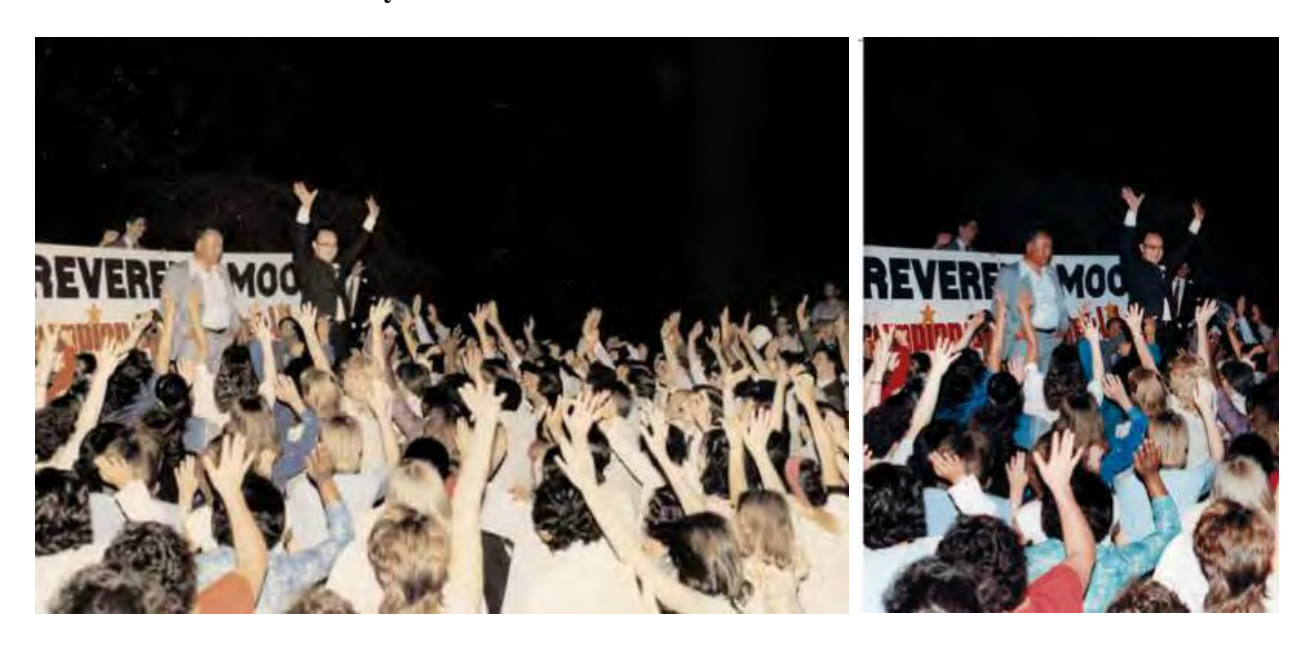
July 20, 1984 True Father Enters Danbury

Having exhausted all of his appeals, including a petition before the U.S. Supreme Court, True Father entered Danbury Federal Correctional Institution on July 20, 1984. He would remain there until July 4, 1985 when he was moved to Phoenix House, a halfway facility in Brooklyn where he served out the reminder of his 13 month incarceration. Prior to departing from East Garden, True Father spoke to gathered members. He told them, "This is a glorious, victorious and historical day" and asked them not "to send me off in tears" unless they were "tears of determination, telling me, 'Trust us. We are going to bring 100 times greater victory in the days to come." He said, "Wherever I go, whether it is a high place or a low one, my life will be the same life" and noted "I am going to prison on the worldwide level at this time," having already gone to prison on the individual, family and national levels.