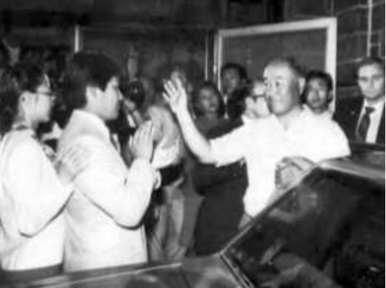
July 22-24, 1974 Three-Day Fast for the Watergate Crisis