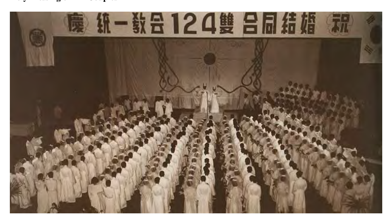
July 24, 1963 Holy Blessing of 124 Couples

True Father noted that the 36 Couples, 72 Couples and 124 Couples "are one team which cannot be separated." Providentially, the 124 Couples (sometimes referred to as 120 Couples) represented Jesus' 120 disciples and signified the nations of the world. The 124 Couple Blessing was one of the conditions by which True Father undertook his first world tour, establishing 120 holy grounds throughout the world. The ceremony was conducted in a community hall and couples paraded through Seoul in a convoy of cars, thereby testifying to the growth of the church before Korean society.