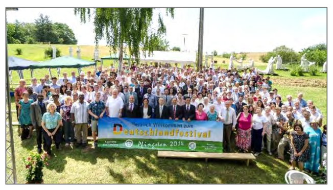
The annual Pentecost Festival of the Family Federation in Germany had gathered some 600 people to seek spiritual revival.

"This year there will be 3 more books in English: Holy Scripture, Peace Scripture and True Parents Scripture. All the most important elements are in these three books. You will discover that these words cannot be spoken by anyone other than the Messiah!"