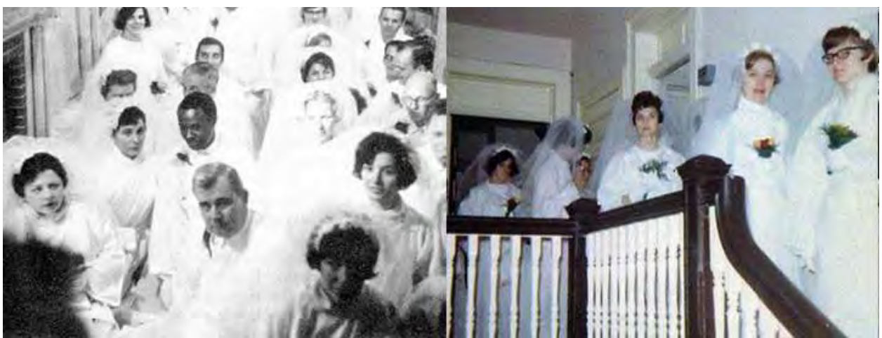
(Left) Thirteen couples, representing the thirteen founding colonies, await True Parents' entrance - (Right) Brides preparing for the Blessing Ceremony at Upshur House