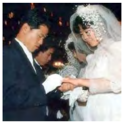
A Korean/Japanese couple exchanges rings during the Wedding Blessing Ceremony on October 30, 1988 at the McCol factory in Yong-in Korea.