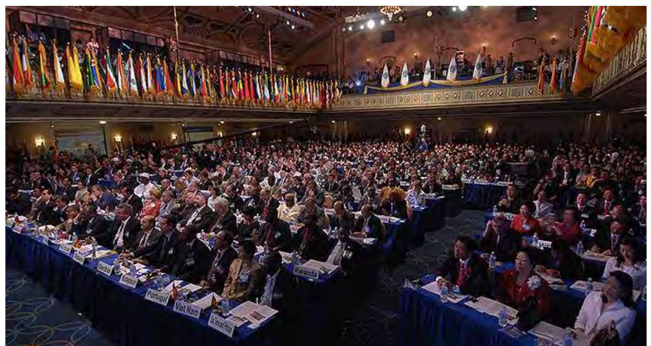
True Father launched the "God-centered" Abel UN on September 23, 2007 at the Assembly 2007 in New York.