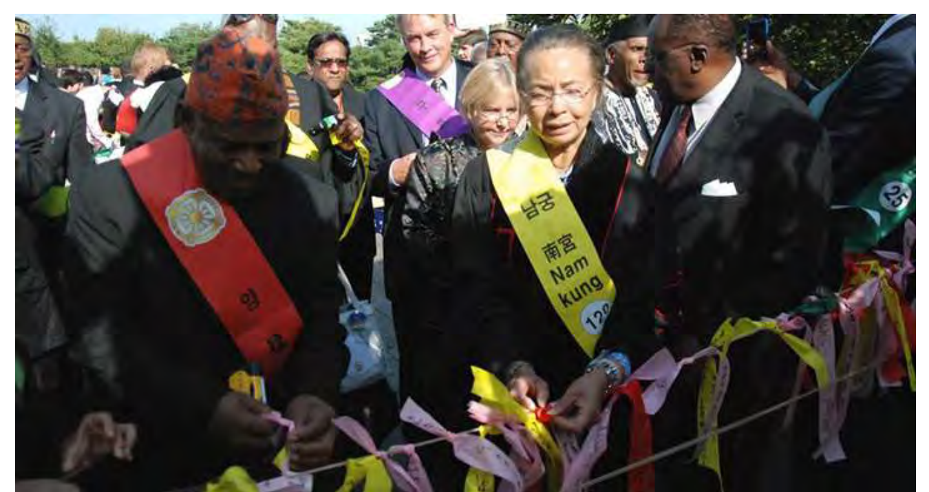
Ministers of different faiths and educational backgrounds attended a peace rally at DMZ after receiving honorary Korean surnames.

172 Christian clergy from a range of denominations completed a historic, unprecedented tour of Korea and joined True Parents to proclaim the mission of Korea as God's central nation of God's kingdom on earth. They arrived in Seoul on Sept. 10, 2011. On September 22, 2011, a delegation of U.S. clergy joined